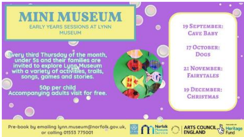
Publicity poster for minimuseum at Lynn Museum for autumn 2024.