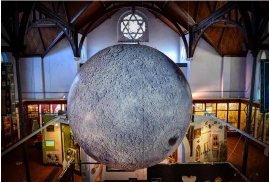
Model of the Moon at Lynn Museum.